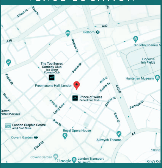
Station 5 minute walk