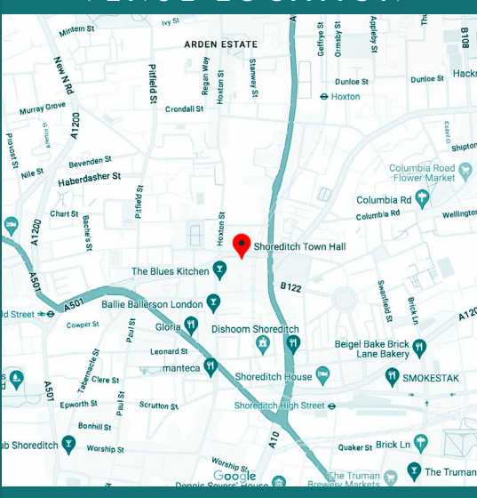
Old Street Station & Shoreditch High Street Station 10 minute walk